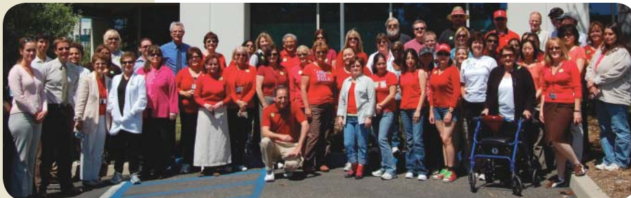
CenCal Health employees participated in the American Heart Association's Walk at Work Day.

Community Focus has been a big priority for CenCal Health over the last year or so. Our goal has been to get more involved in our community at large, and in both counties. We're happy to report that we've been very busy and feel confident that we are doing outreach that is critical to our members. There is not enough space to inform the reader of all the activities we've been involved in so we will highlight our two biggest achievements over the past year. These included the 1st Annual Childhood Obesity Summit in January 2008, in addition to our focus on heart health and our partnership with the American Heart Association. The Obesity Summit was a great success, drawing over 130 healthcare professionals from both Santa Barbara and San Luis Obispo counties together to discover the latest thinking on the obesity epidemic in this country. Specifically, we have started with childhood obesity, and will work our way towards adult obesity in time. This forum allowed people to learn from each other, network, and brainstorm. A 2nd Annual Obesity Summit is scheduled for February 11, 2009.